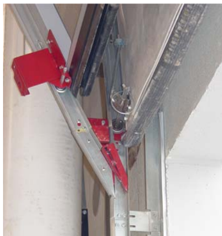
Diverter Switch with bottom fixture

Track Mounting Options for 2" or 3" vertical or high lift track.